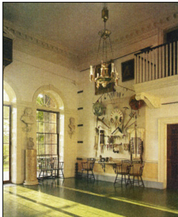
Entrance hall at Monticello

We’ll spend today touring the Gettysburg Battlefield at the Gettysburg National Military Park. We’ll start out the day at