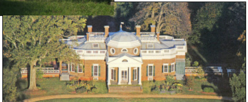
Thomas Jefferson's beloved Monticello