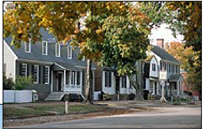
Duke of Gloucester Street in Colonial Williamsburg

Right: Duke of Gloucester Street at Colonial Williamsburg, Gettysburg Battlefield, and Thomas Jefferson's Monticello.