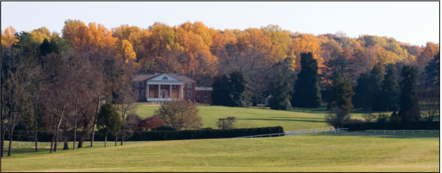
Montpelier, the newly-restored home of James and Dolley Madison

the Gettysburg Museum and Visitor Center. The 22,000 square-foot museum gallery displays Civil War artifacts from one of the largest museum collections in America. It also features interactive programs and multi-media presentations. A new orientation film, A New Birth of Freedom (narrated by actor Morgan Freeman) explains the battle and its importance to American history.