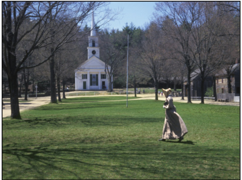
Old Sturbridge Village