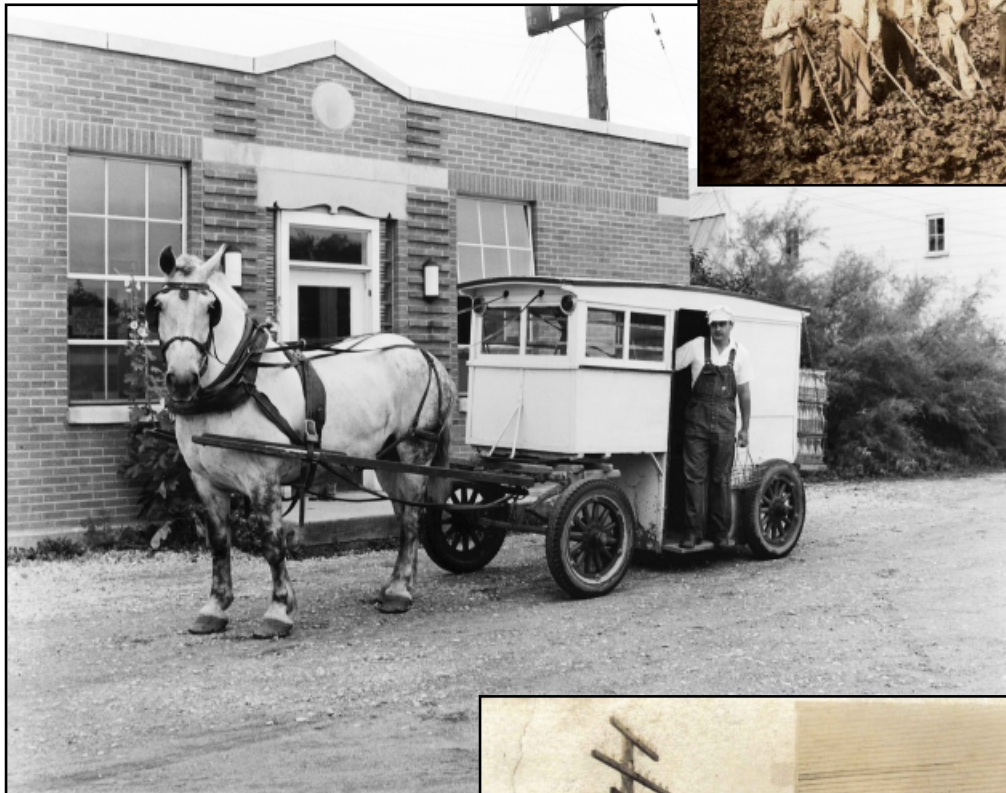
Milk wagon at Emmanuel Missionary College.