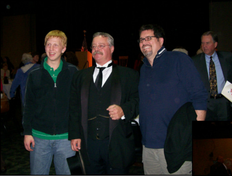
Like all politicians, President Roosevelt was glad to meet and greet visitors!