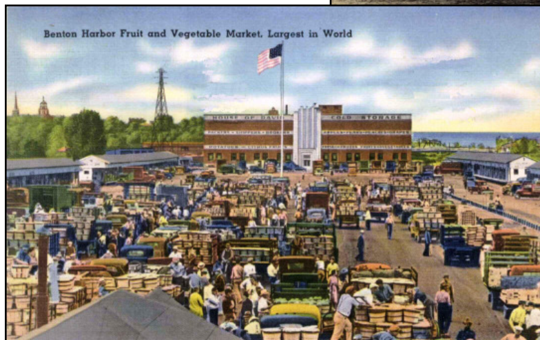
The Israelite House of David cold storage plant at the Benton Harbor Fruit Market.