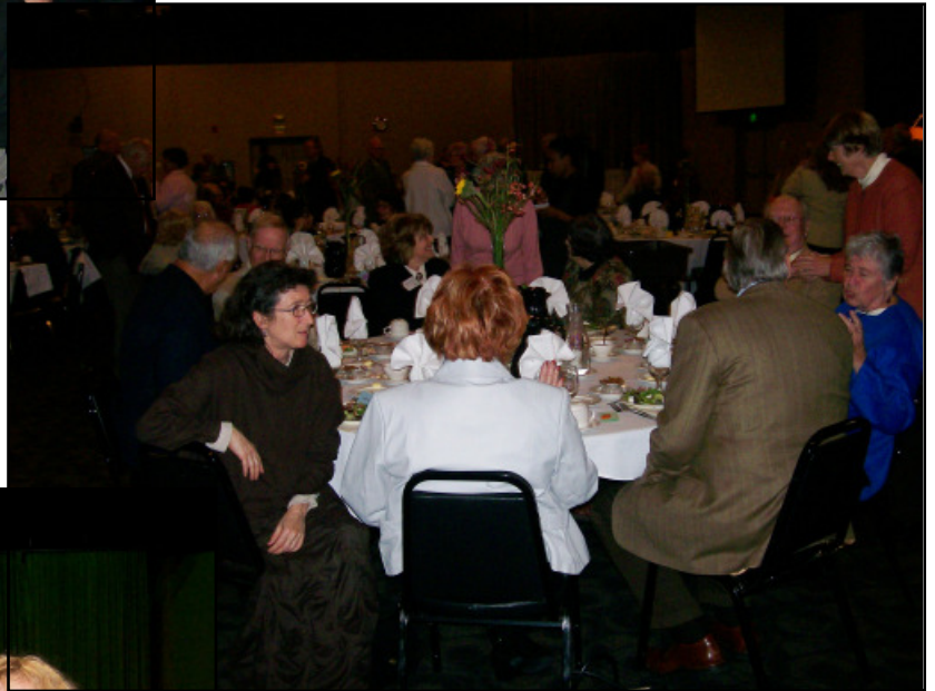
Guests enjoyed an excellent meal and dinner conversation.