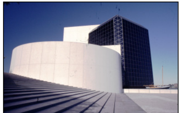
The JFK Presidential Museum, Boston

The nine-day, eight-night tour is scheduled for September 10-19, 2011. More information will be coming out in future issues of The Docket , but if you would like to receive detailed information as it becomes available, contact us via email at bcha@berrienhistory.org or call us at (269) 471-1202.