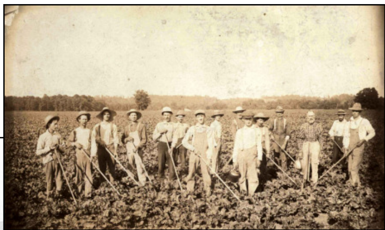
Working in a beet field at the Shaker Farm, Berrien Springs, ca. 1900.