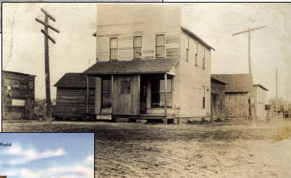
Farm implement dealership at Arden, ca. 1900. The building still stands on M-139 (Old US 31) five miles north of Berrien Springs.